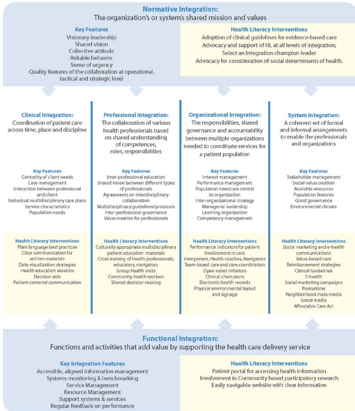
FIGURE 3-1. Comprehensive Modified–Rainbow Model of Integrated Care and Health Literacy

used only publications about existing programs that sufficiently described the integration type and the service and population group provided so that we could characterize the type and level of integration involved. Each program is counted only once, unless specific sites are described within the publication that explains the information above on a site-specific basis.