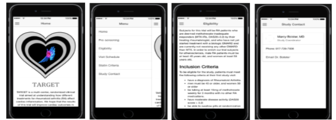
Personalized with study graphics | Custom menu navigation | Organized study information | Site specific contact with one-click access to email or call